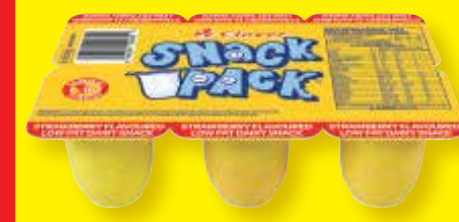
CLOVER SNACK PACK DAIRY SNACK ALL VARIANTS 6x50g PER PACK