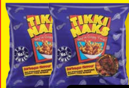
TIKKI NAKS SNACK ALL VARIANTS 16g EACH