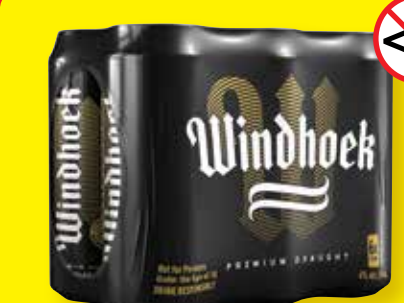
WINDHOEK DRAUGHT BEER 6x500ml CANS PER PACK