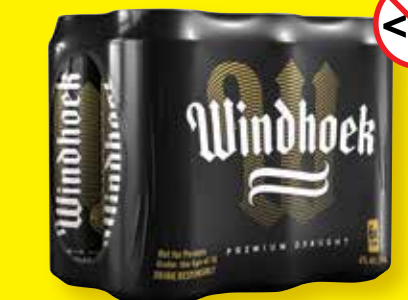
WINDHOEK DRAUGHT BEER 6x500ml CANS PER PACK