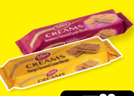
TIFFANY CREAMS BISCUITS ALL VARIANTS 84g EACH