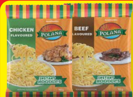
POLANA INSTANT NOODLES ALL VARIANTS 70g EACH