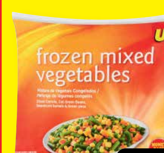
UBRAND FROZEN MIXED VEGETABLES 1kg