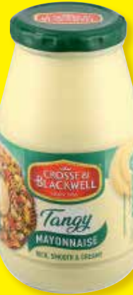
CROSSE & BLACKWELL TANGY MAYONNAISE 750g