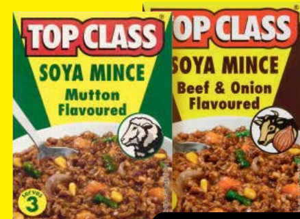
TOP CLASS SOYA MINCE ALL VARIANTS 400g EACH