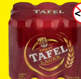
TAFEL LAGER BEER 6x500ml CANS PER PACK