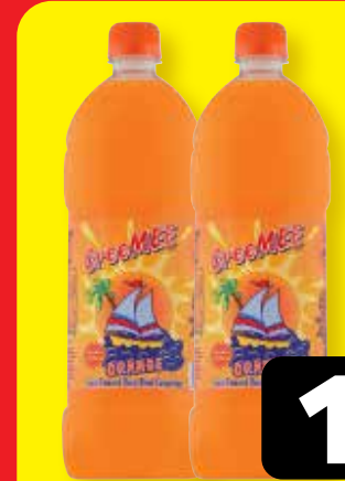
VITA JUICE CREEMEE DAIRY BLEND CONCENTRATE 1/ EACH