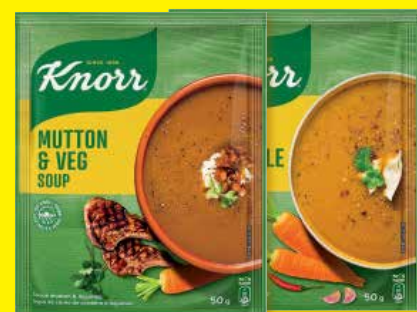
KNORR REGULAR/PACKET SOUP ALL VARIANTS 50g EACH