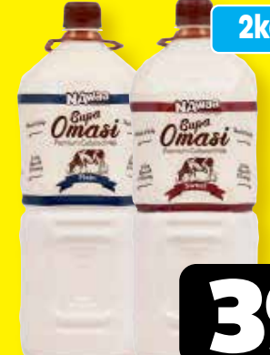
NAWAA SUPA OMASI ALL VARIANTS 2kg EACH