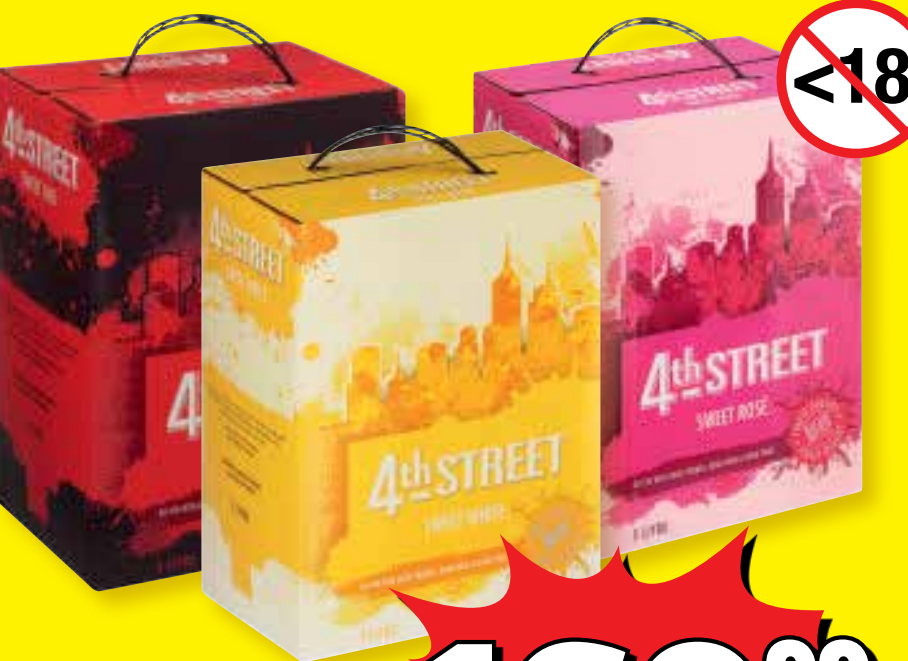
4TH STREET NATURAL SWEET WHITE/SWEET RED/SWEET ROSE WINE 5/ EACH