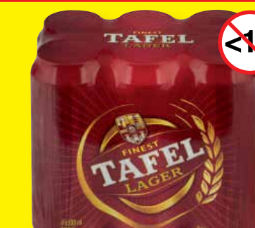
TAFEL LAGER BEER 6x500ml CANS PER PACK