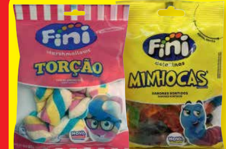
FINI SWEETS ALL VARIANTS 90g EACH