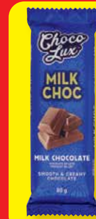
CHOCO LUX MILK CHOCOLATE SLAB 80g