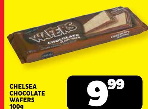
CHELSEA CHOCOLATE WAFERS 100g