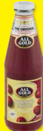
ALL GOLD TOMATO SAUCE 700ml