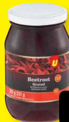
UBRAND GRATED BEETROOT 385g