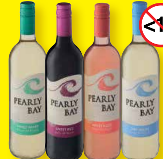
PEARLY BAY SWEET RED/SWEET ROSE/ SWEET WHITE/DRY WHITE WINE 750ml EACH