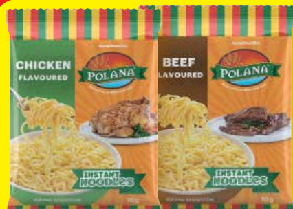
POLANA INSTANT NOODLES ALL VARIANTS 70g EACH