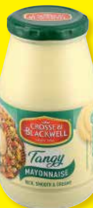
CROSSE & BLACKWELL TANGY MAYONNAISE 750g