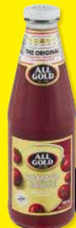
ALL GOLD TOMATO SAUCE 700ml