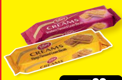
TIFFANY CREAMS BISCUITS ALL VARIANTS 84g EACH