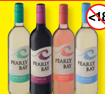
PEARLY BAY SWEET RED/SWEET ROSE/ SWEET WHITE/DRY WHITE WINE 750ml EACH