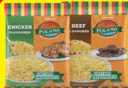
POLANA INSTANT NOODLES ALL VARIANTS 70g EACH