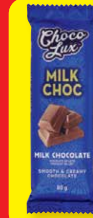
CHOCO LUX MILK CHOCOLATE SLAB 80g