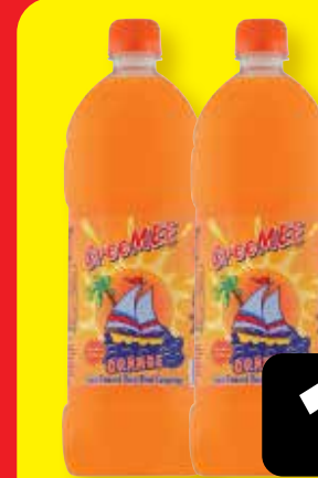
VITA JUICE CREEMEE DAIRY BLEND CONCENTRATE 1/ EACH