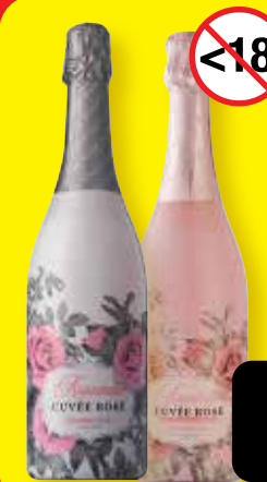
KWV ANNABELLE CUVÉE ROSE/BLANCHE (INCLUDING NON-ALCOHOLIC) SPARKLING WINE 750ml EACH