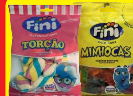
FINI SWEETS ALL VARIANTS 90g EACH