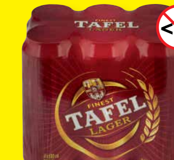
TAFEL LAGER BEER 6x500ml CANS PER PACK