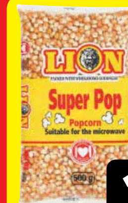
LION POPCORN KERNELS 500g