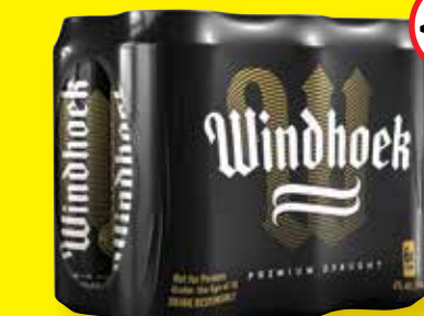
WINDHOEK DRAUGHT BEER 6x500ml CANS PER PACK