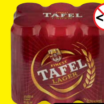
TAFEL LAGER BEER 6x500ml CANS PER PACK