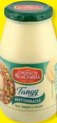
CROSSE & BLACKWELL TANGY MAYONNAISE 750g