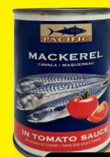
PACIFIC MACKEREL IN TOMATO SAUCE 155g