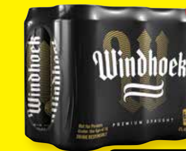
WINDHOEK DRAUGHT BEER 6x500ml CANS PER PACK