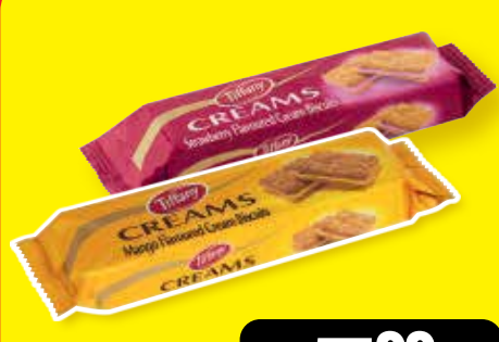
TIFFANY CREAMS BISCUITS ALL VARIANTS 84g EACH