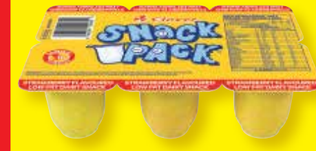
CLOVER SNACK PACK DAIRY SNACK ALL VARIANTS 6x50g PER PACK