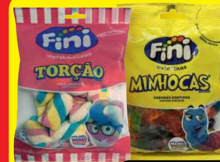
FINI SWEETS ALL VARIANTS 90g EACH