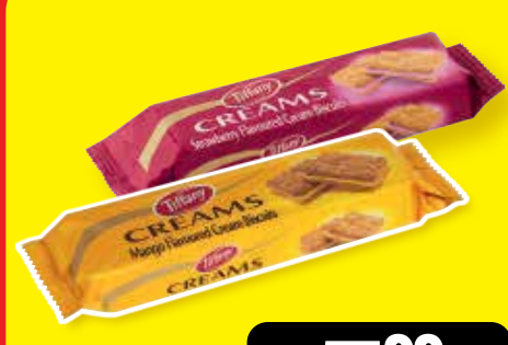
TIFFANY CREAMS BISCUITS ALL VARIANTS 84g EACH