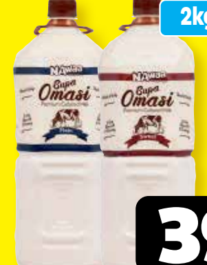
NAWAA SUPA OMASI ALL VARIANTS 2kg EACH