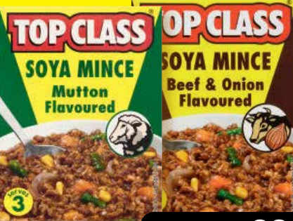
TOP CLASS SOYA MINCE ALL VARIANTS 400g EACH