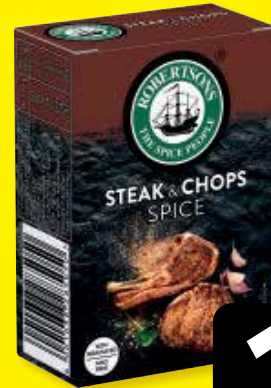
ROBERTSON'S SPICES ALL VARIANTS 80g EACH