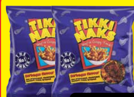
TIKKI NAKS SNACK ALL VARIANTS 16g EACH