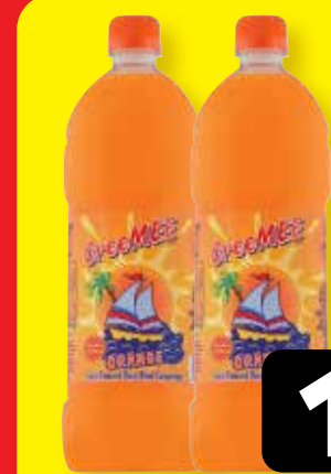
VITA JUICE CREEMEE DAIRY BLEND CONCENTRATE 1/ EACH