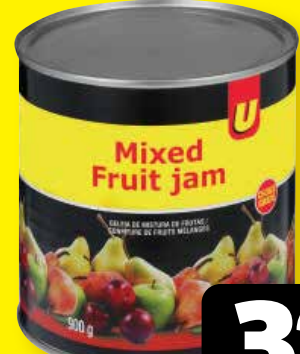
UBRAND MIXED FRUIT JAM 900g