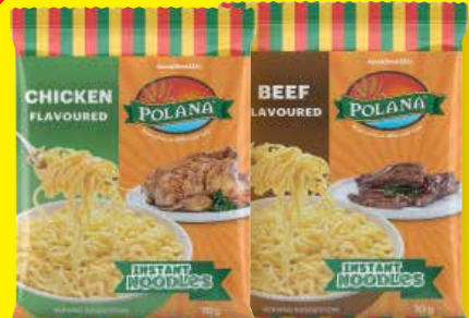
POLANA INSTANT NOODLES ALL VARIANTS 70g EACH