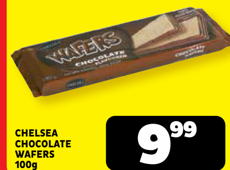
CHELSEA CHOCOLATE WAFERS 100g