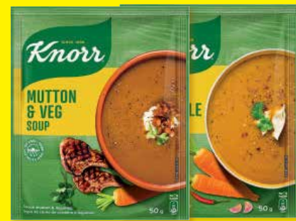
KNORR REGULAR/PACKET SOUP ALL VARIANTS 50g EACH