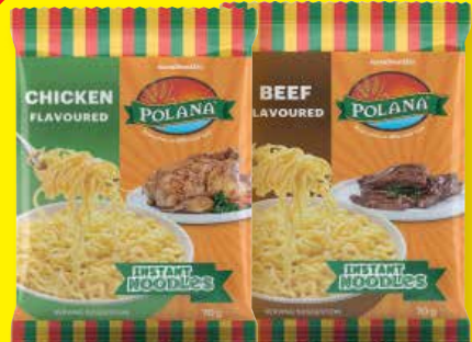
POLANA INSTANT NOODLES ALL VARIANTS 70g EACH