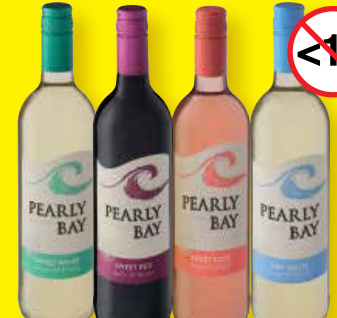
PEARLY BAY SWEET RED/SWEET ROSE/ SWEET WHITE/DRY WHITE WINE 750ml EACH