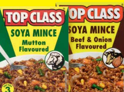
TOP CLASS SOYA MINCE ALL VARIANTS 400g EACH