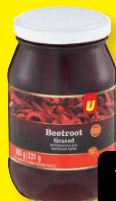
UBRAND GRATED BEETROOT 385g