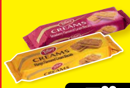
TIFFANY CREAMS BISCUITS ALL VARIANTS 84g EACH