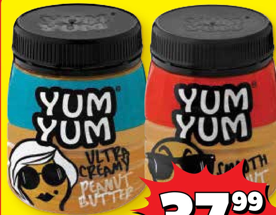
YUM YUM PEANUT BUTTER ALL VARIANTS 400g EACH