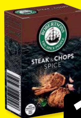
ROBERTSON'S SPICES ALL VARIANTS 80g EACH