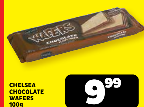
CHELSEA CHOCOLATE WAFERS 100g