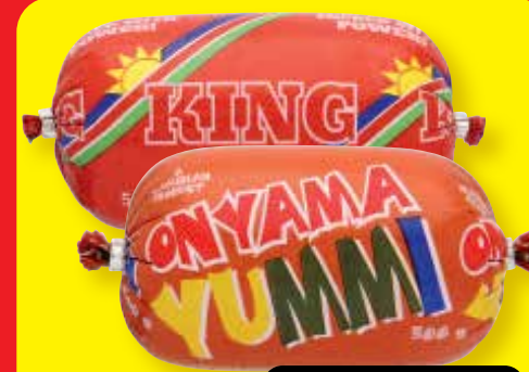
KING FRENCH POLONY/CHAMPION ONYAMA YUMMI POLONY 500g EACH