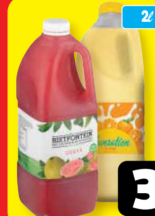
RIETFONTEIN FRUIT NECTAR BLEND/DAIRY FRUIT BLEND ALL VARIANTS 2/ EACH