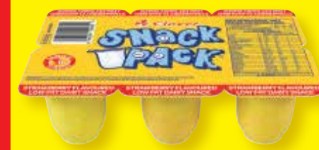
CLOVER SNACK PACK DAIRY SNACK ALL VARIANTS 6x50g PER PACK