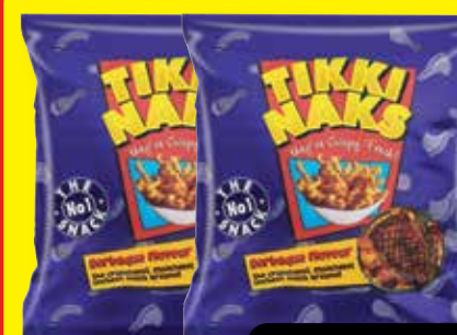
TIKKI NAKS SNACK ALL VARIANTS 16g EACH