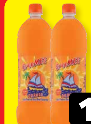
VITA JUICE CREEMEE DAIRY BLEND CONCENTRATE 1/ EACH