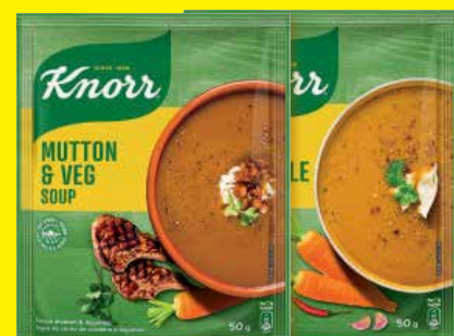
KNORR REGULAR/PACKET SOUP ALL VARIANTS 50g EACH