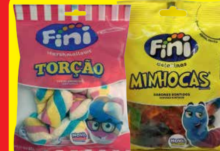
FINI SWEETS ALL VARIANTS 90g EACH