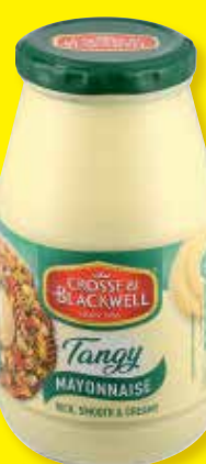
CROSSE & BLACKWELL TANGY MAYONNAISE 750g