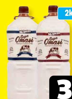
NAWAA SUPA OMASI ALL VARIANTS 2kg EACH