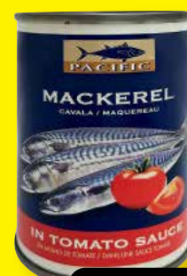
PACIFIC MACKEREL IN TOMATO SAUCE 155g