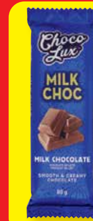
CHOCO LUX MILK CHOCOLATE SLAB 80g