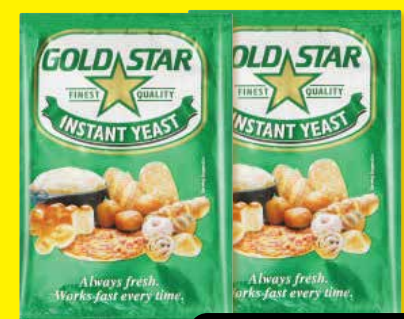
GOLD STAR INSTANT YEAST 10g EACH