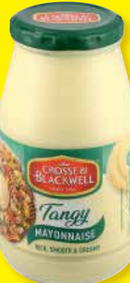
CROSSE & BLACKWELL TANGY MAYONNAISE 750g