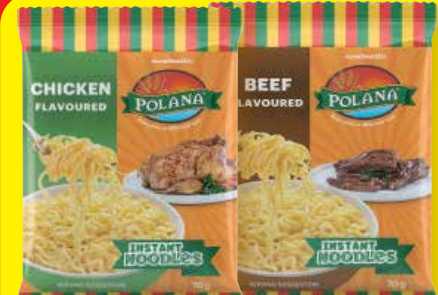
POLANA INSTANT NOODLES ALL VARIANTS 70g EACH