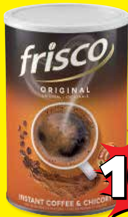
FRISCO INSTANT COFFEE & CHICORY 750g