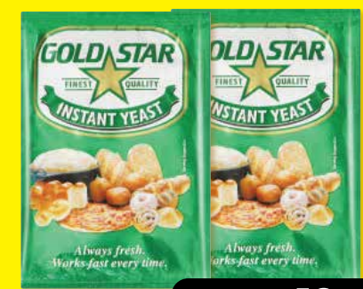
GOLD STAR INSTANT YEAST 10g EACH