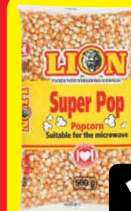
LION POPCORN KERNELS 500g