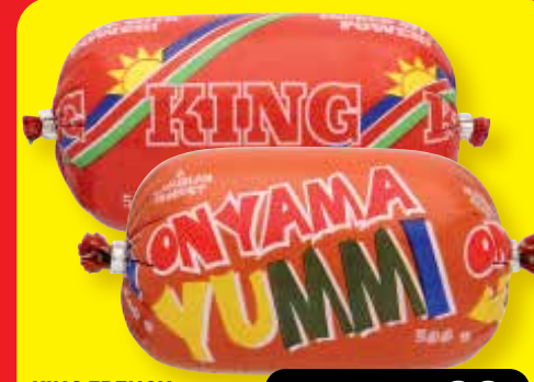
KING FRENCH POLONY/CHAMPION ONYAMA YUMMI POLONY 500g EACH