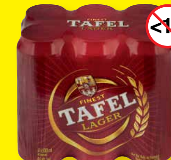
TAFEL LAGER BEER 6x500ml CANS PER PACK