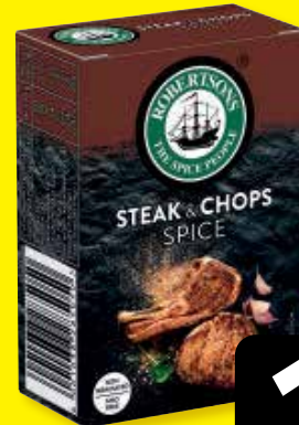
ROBERTSON'S SPICES ALL VARIANTS 80g EACH