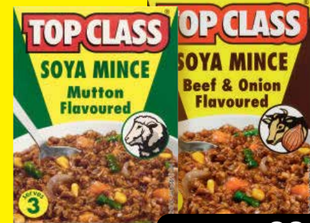
TOP CLASS SOYA MINCE ALL VARIANTS 400g EACH