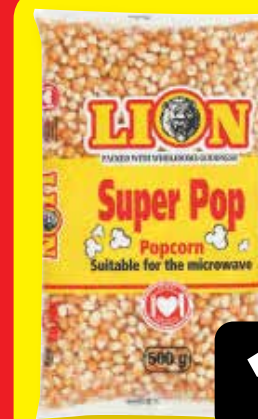
LION POPCORN KERNELS 500g