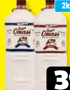
NAWAA SUPA OMASI ALL VARIANTS 2kg EACH