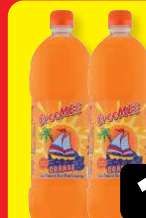
VITA JUICE CREEMEE DAIRY BLEND CONCENTRATE 1/ EACH