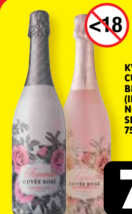
KWV ANNABELLE CUVÉE ROSE/ BLANCHE (INCLUDING NON-ALCOHOLIC) SPARKLING WINE 750ml EACH