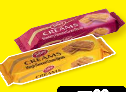
TIFFANY CREAMS BISCUITS ALL VARIANTS 84g EACH