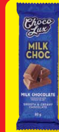
CHOCO LUX MILK CHOCOLATE SLAB 80g