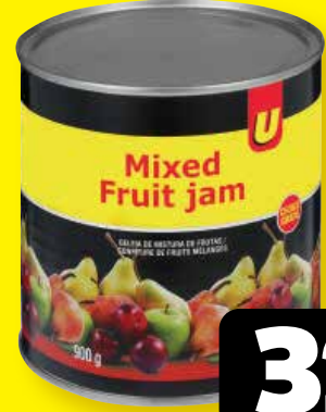
UBRAND MIXED FRUIT JAM 900g