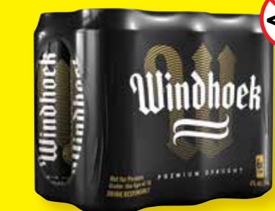
WINDHOEK DRAUGHT BEER 6x500ml CANS PER PACK