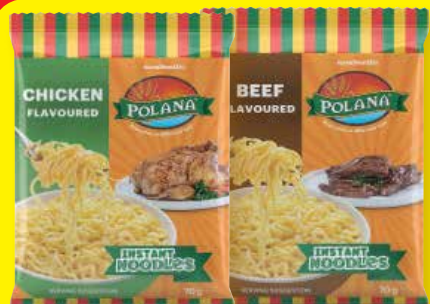
POLANA INSTANT NOODLES ALL VARIANTS 70g EACH