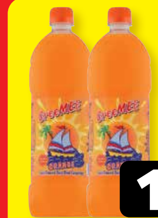
VITA JUICE CREEMEE DAIRY BLEND CONCENTRATE 1/ EACH