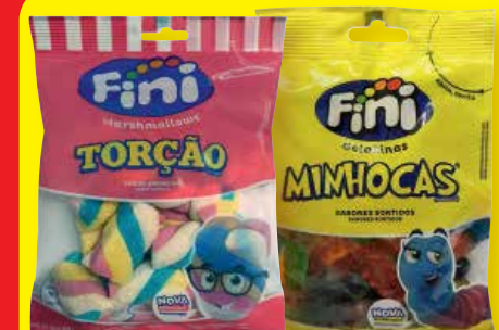
FINI SWEETS ALL VARIANTS 90g EACH