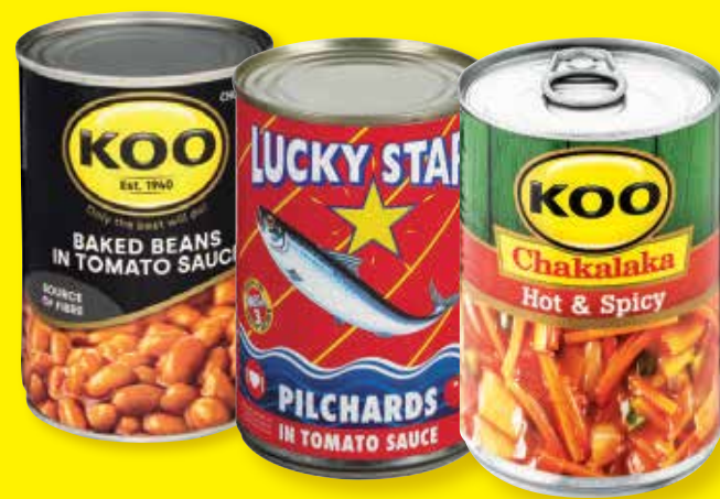
KOO BAKED BEANS IN TOMATO SAUCE 400g/401g EACH + KOO CHAKALAKA ALL VARIANTS 410g EACH + LUCKY STAR PILCHARDS IN TOMATO/CHILLI SAUCE 155g EACH