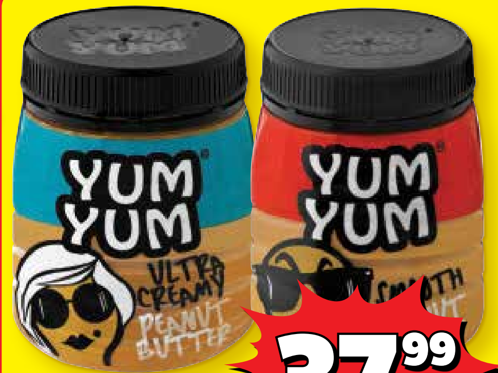
YUM YUM PEANUT BUTTER ALL VARIANTS 400g EACH