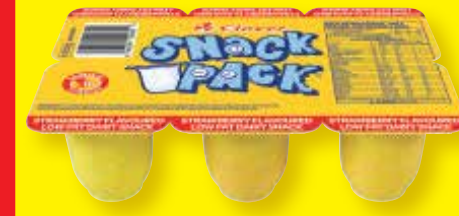
CLOVER SNACK PACK DAIRY SNACK ALL VARIANTS 6x50g PER PACK