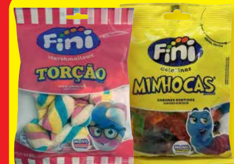
FINI SWEETS ALL VARIANTS 90g EACH