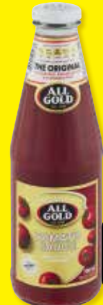
ALL GOLD TOMATO SAUCE 700ml