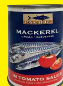
PACIFIC MACKEREL IN TOMATO SAUCE 155g