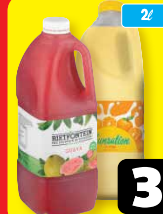
RIETFONTEIN FRUIT NECTAR BLEND/DAIRY FRUIT BLEND ALL VARIANTS 2/ EACH