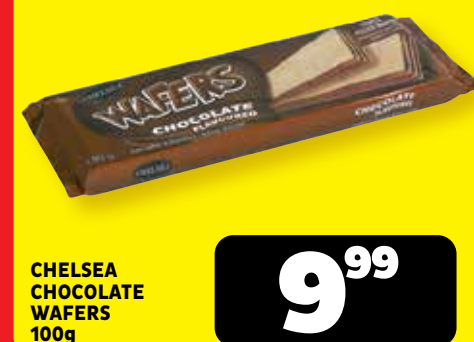
CHELSEA CHOCOLATE WAFERS 100g