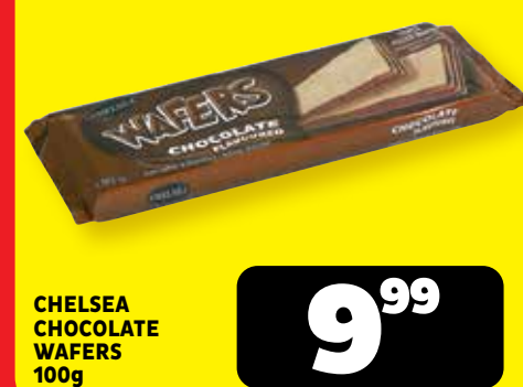
CHELSEA CHOCOLATE WAFERS 100g