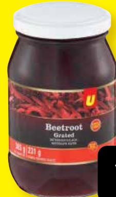
UBRAND GRATED BEETROOT 385g