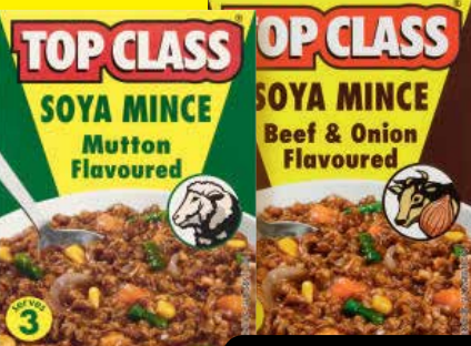
TOP CLASS SOYA MINCE ALL VARIANTS 400g EACH