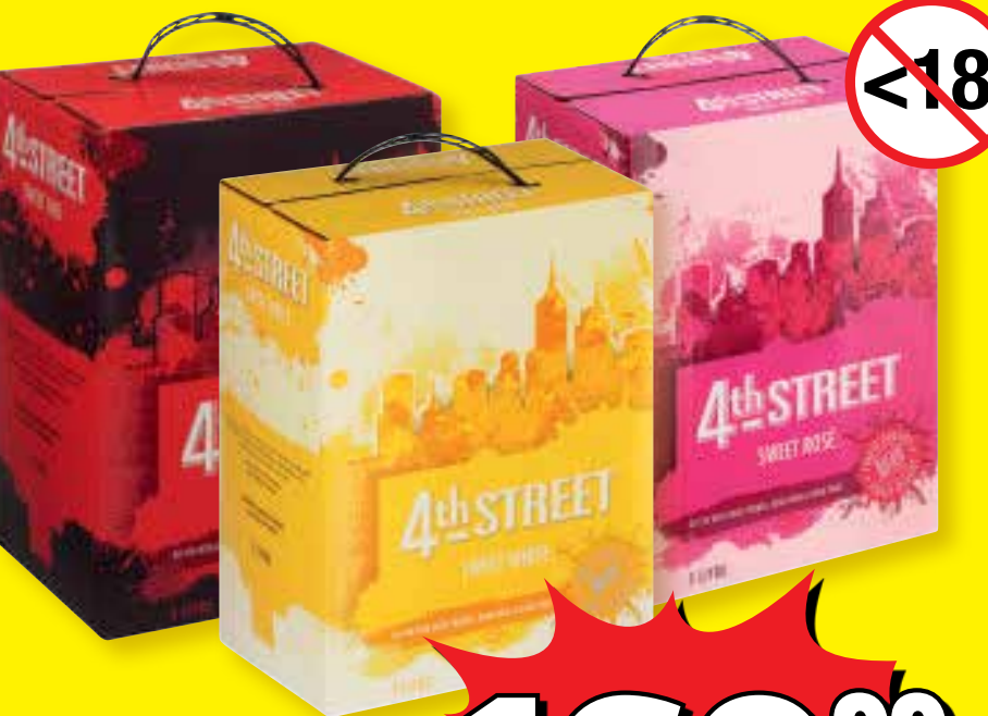
4TH STREET NATURAL SWEET WHITE/SWEET RED/SWEET ROSE WINE 5/ EACH