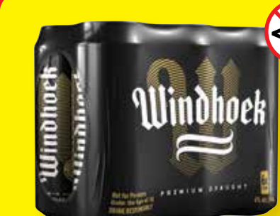
WINDHOEK DRAUGHT BEER 6x500ml CANS PER PACK