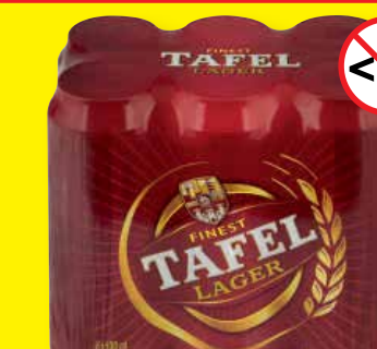
TAFEL LAGER BEER 6x500ml CANS PER PACK