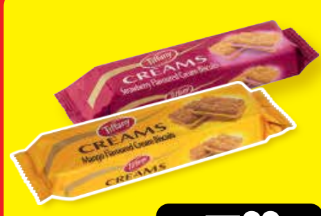
TIFFANY CREAMS BISCUITS ALL VARIANTS 84g EACH