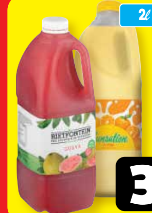
RIETFONTEIN FRUIT NECTAR BLEND/DAIRY FRUIT BLEND ALL VARIANTS 2/ EACH