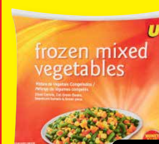
UBRAND FROZEN MIXED VEGETABLES 1kg