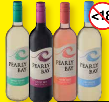
PEARLY BAY SWEET RED/SWEET ROSE/ SWEET WHITE/DRY WHITE WINE 750ml EACH