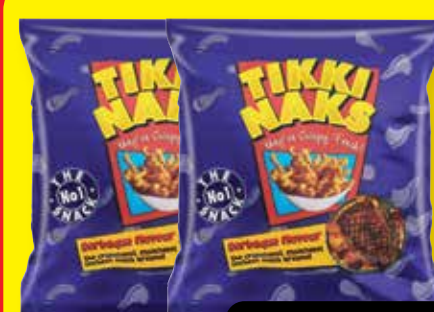
TIKKI NAKS SNACK ALL VARIANTS 16g EACH