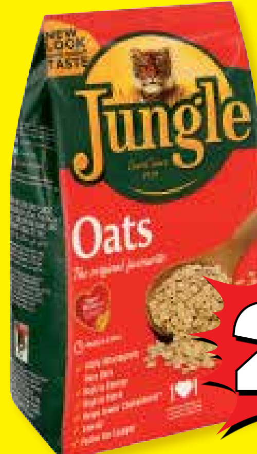
JUNGLE OATS ORIGINAL PORRIDGE 500g