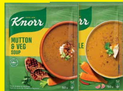
KNORR REGULAR/PACKET SOUP ALL VARIANTS 50g EACH